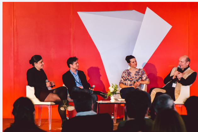
Talks, Papier15 fair