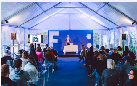
Talks, Feature art fair 2015